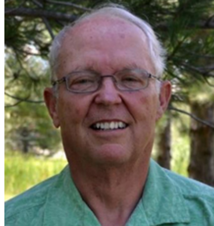
Mechanical Engineer and Engineering Manager