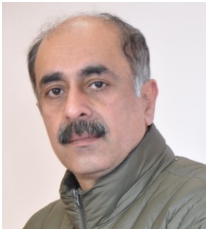
MBA in Strategy MA in International Relations