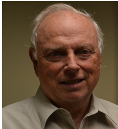
Civil Engineer President of EFN-USA President of Go Nuclear